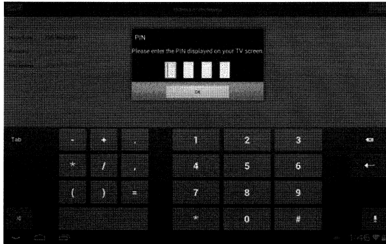
(Sample Illustration) Toshiba A/V Remote App—Input PIN code screen