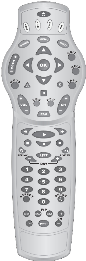
© 2004 ICX Global, Inc. All rights reserved. Part Number ICX18346, version 1.0 07012004

VISIT US ON THE WEB YOU CAN FIND PROGRAMMING INSTRUCTIONS AND CODES FOR ALL OF OUR REMOTE CONTROLS, AS WELL AS INFORMATION ABOUT OUR OTHER PRODUCTS ON OUR WEBSITE: www.icxglobal.com